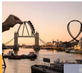
Cut and Paste