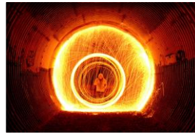
Cut and Paste