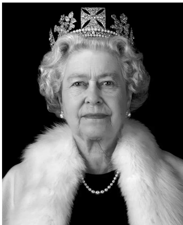
Queen Elizabeth II 1926 - 2022